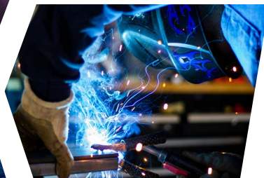
SMART MANUFACTURING BEST PRACTICES AND USE CASES