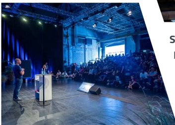
IMMERSE YOURSELF INTO THE CLOUD NATIVE WORLD